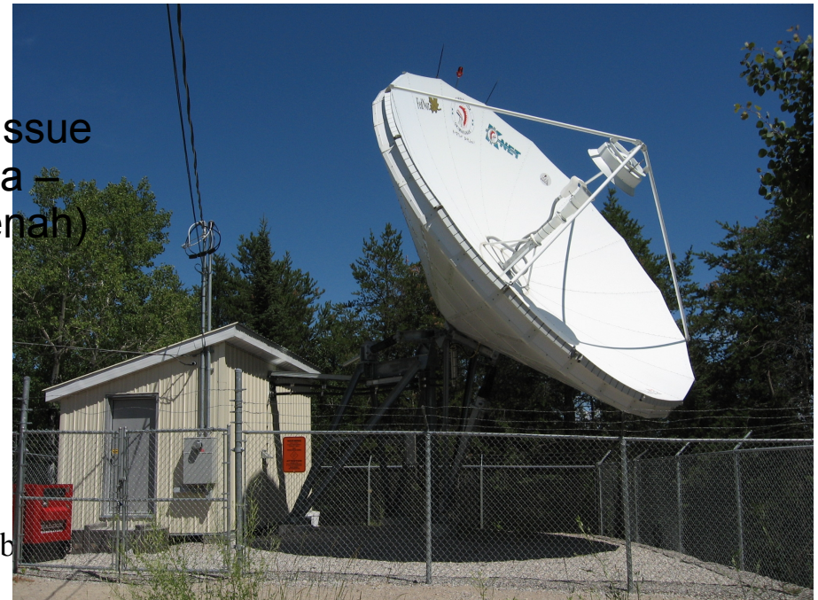
Budka - Indigenous Cyb